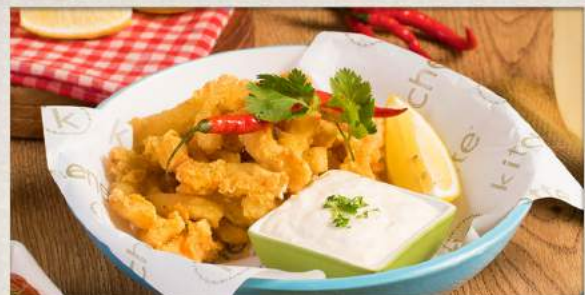
Crispy Calamari Fritto 65 with ginger mayo