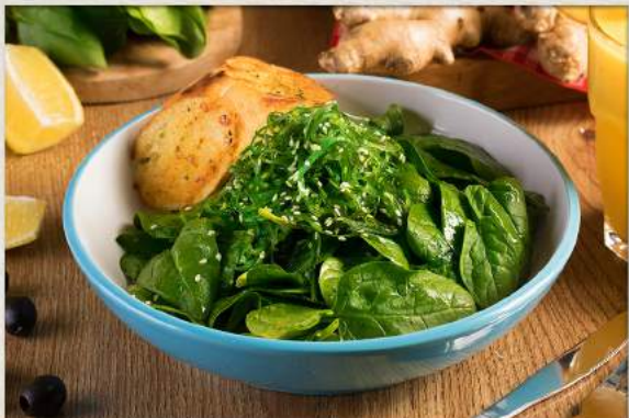
Baby Spinach Salad 69 with seaweed & ginger sesame dressing