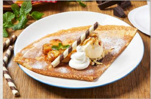
Banana Creme Caramel 65

fresh orange, caramelized almonds, granulated sugar, orange zest, caramel sauce & vanilla ice cream