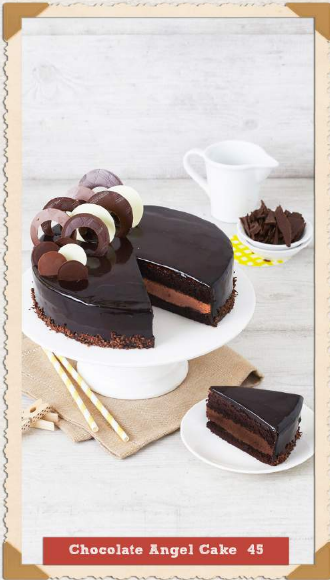
Chocolate Angel Cake 45