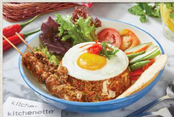
The Maid's Nasi Goreng 105 traditional Indonesian style nasi goreng with seafood, fried egg & chicken satay