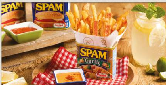
Spam Fries (Pork) 89 with sriracha mayo