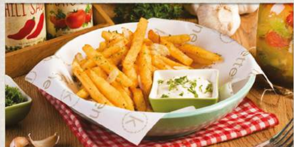
Garlic Fries 49 with aioli sauce