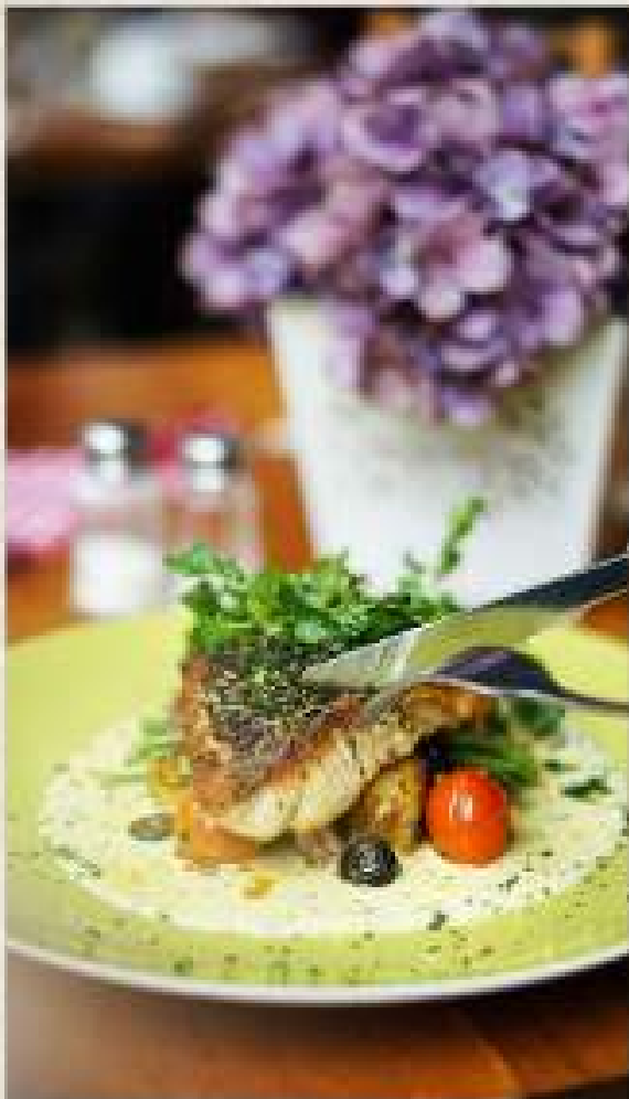
Riviera Style Barramundi 129 with roasted potato, lemon & herbs, olive, tomato & garlic butter sauce