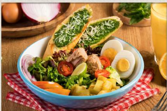
Tuna Nicoise Salad 85 with olives, boiled egg, red onion, pesto lemon dressing & toasted bread