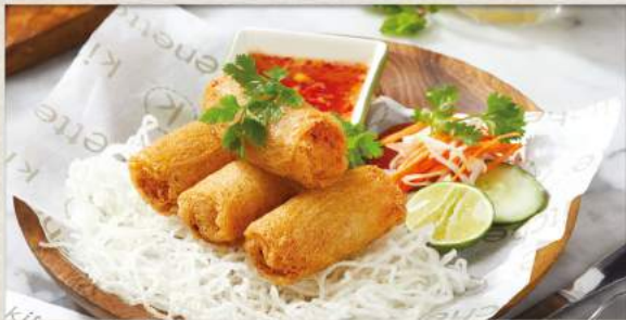
Vietnamese Fried Spring Rolls 59 minced chicken, carrot, jicama & chili vinegar sauce