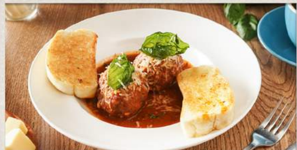
NEW Italian Meatballs 70 with rustic tomato sauce & ciabatta bread