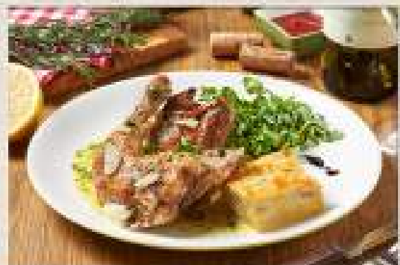
Half Roasted Chicken 119 with garlic butter sauce & potato gratin