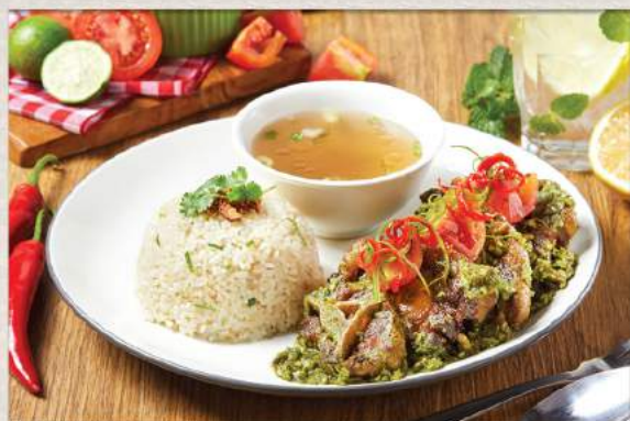
Spicy Fried Oxtails 179 with green chili sambal & hainan rice