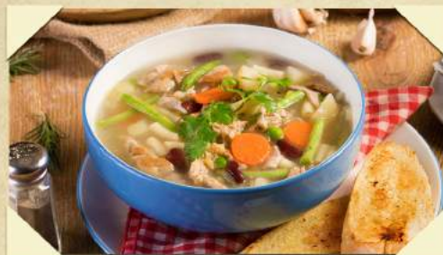
macaroni, red bean, shredded chicken, vegetables & garlic bread