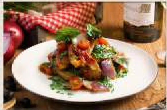
Mediterranean John Dory Fish 99

over sautéed garlic spinach, roasted potato & homemade tomato sauce