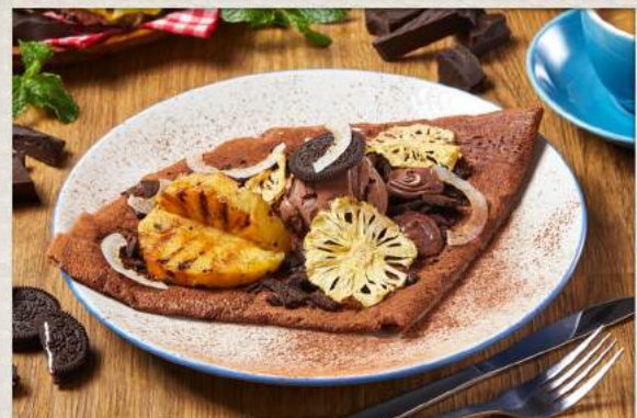
Chocolate Trio 79

sautéed banana, chocolate hazelnut spread, grated cheese, caramel & vanilla ice cream