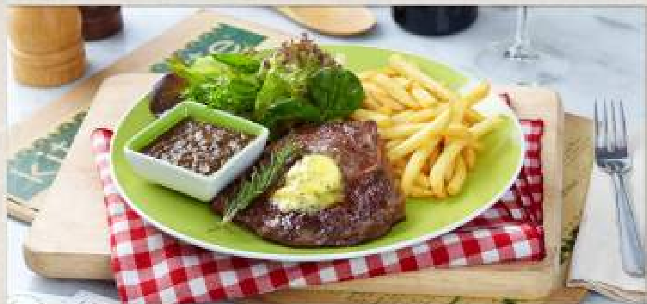
Kitchenette Steak-Frites 199

200g Australian wagyu rib eye steak, mushroom sauce, garlic butter & fries ( add egg 19 | truffle mushrooms 25 )