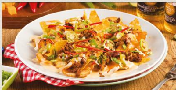
"Nacho Style" Crispy Potatoes 85 with tortilla chips, chili con carne, melted cheddar & jalapeno