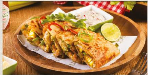
Tex-mex Quesadilla 75 chicken, corn, mozzarella, jalapenos, bell pepper, habanero & sour cream