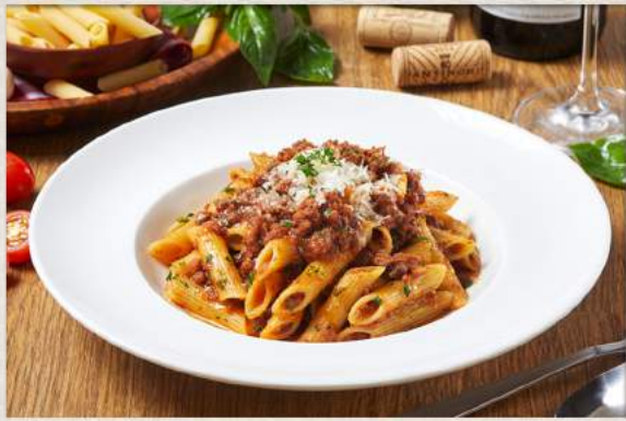
Penne Bolognese 75 with traditional beef ragout & parmesan cheese