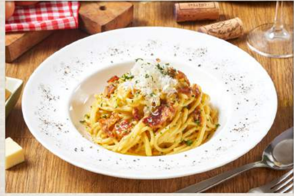
Spaghetti a la Carbonara 85 with parmesan cheese & egg [chicken ham or pork bacon]