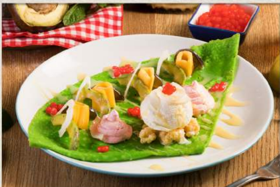
Es Teler Crêpe 59

chocolate crêpe, hazelnut spread, cocoa powder, pineapple, chocolate cookie & chocolate ice cream