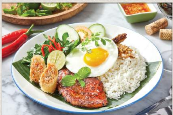
"Little Saigon" Grilled Pork Chop 145 with side of Vietnamese spring roll, fried egg, cha gio dressing & jasmine rice