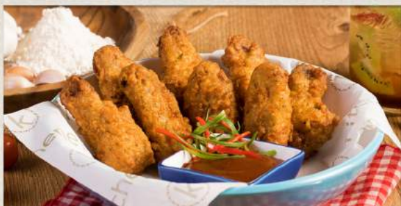
Crispy Chicken Wings 69 with homemade barbeque sauce