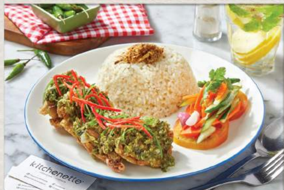
Crispy Chicken "Cabai Hijau" 85 with hainan rice & pickled vegetables