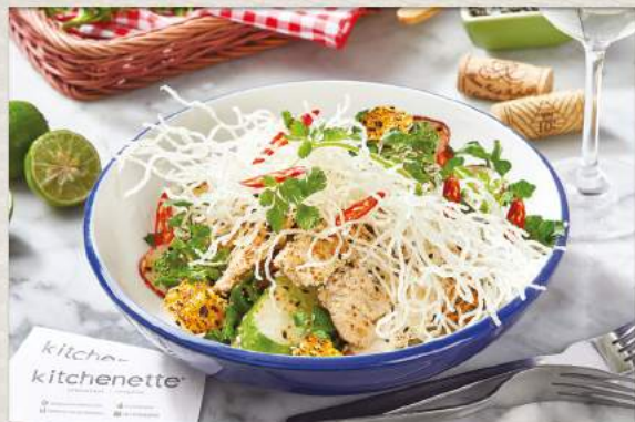
Oriental Chicken Salad 75 kale, grilled corn, cucumber & sesame dressing