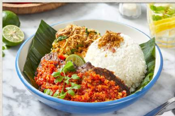
Wagyu Beef Brisket Balado 135 with jasmine rice & urap vegetable