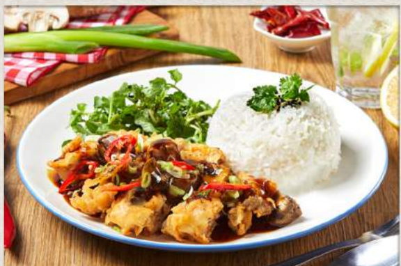
Chicken Teriyaki 85 with sautéed mushrooms & jasmine rice