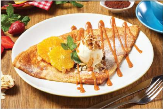
Classic Citrus 45

fresh orange, caramelized almonds, granulated sugar, orange zest, caramel sauce & vanilla ice cream