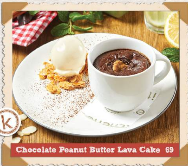
Chocolate Peanut Butter Lava Cake 69